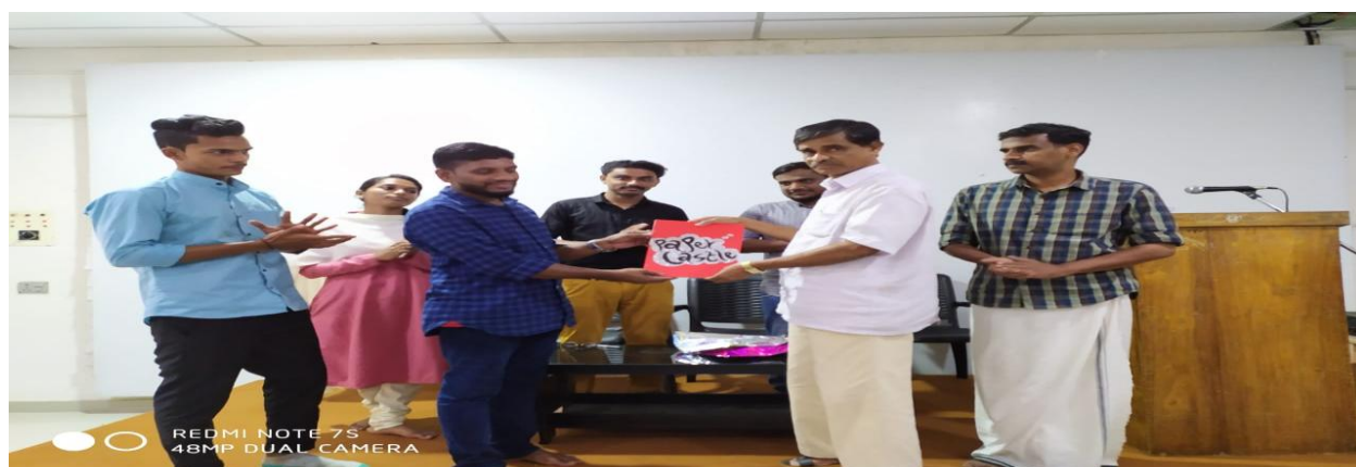
Principal,Markaz college releasing English department magazine