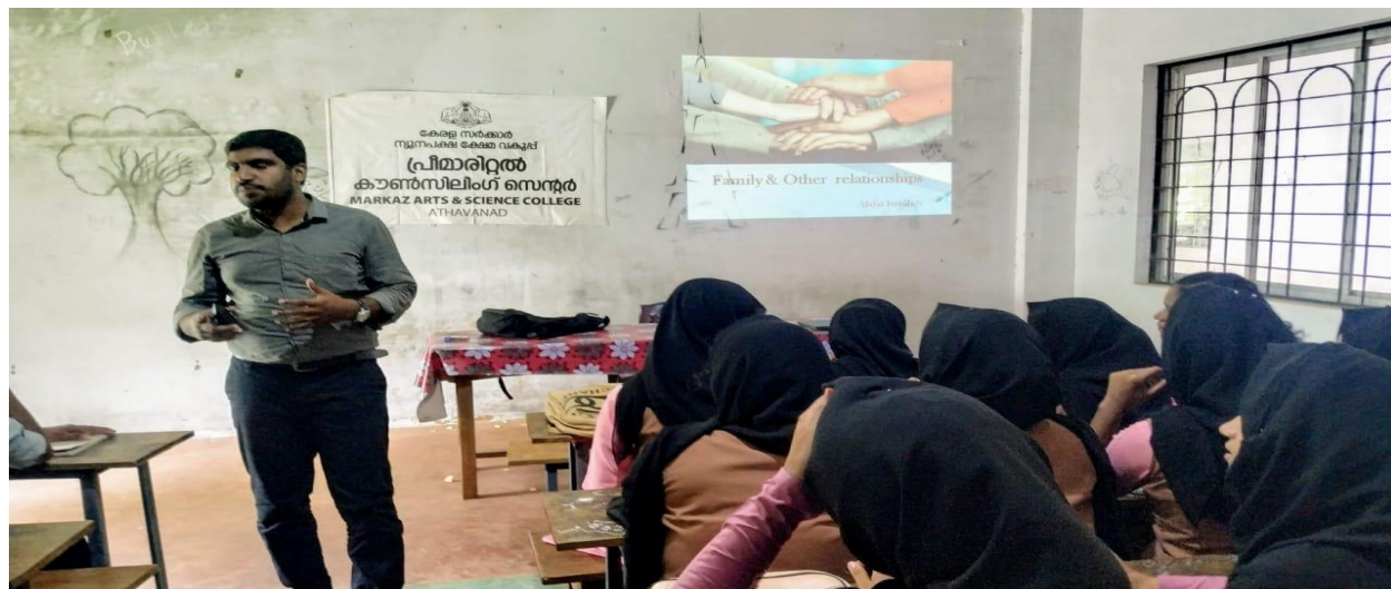
From premarital workshop by Dept.of Minority Welfare