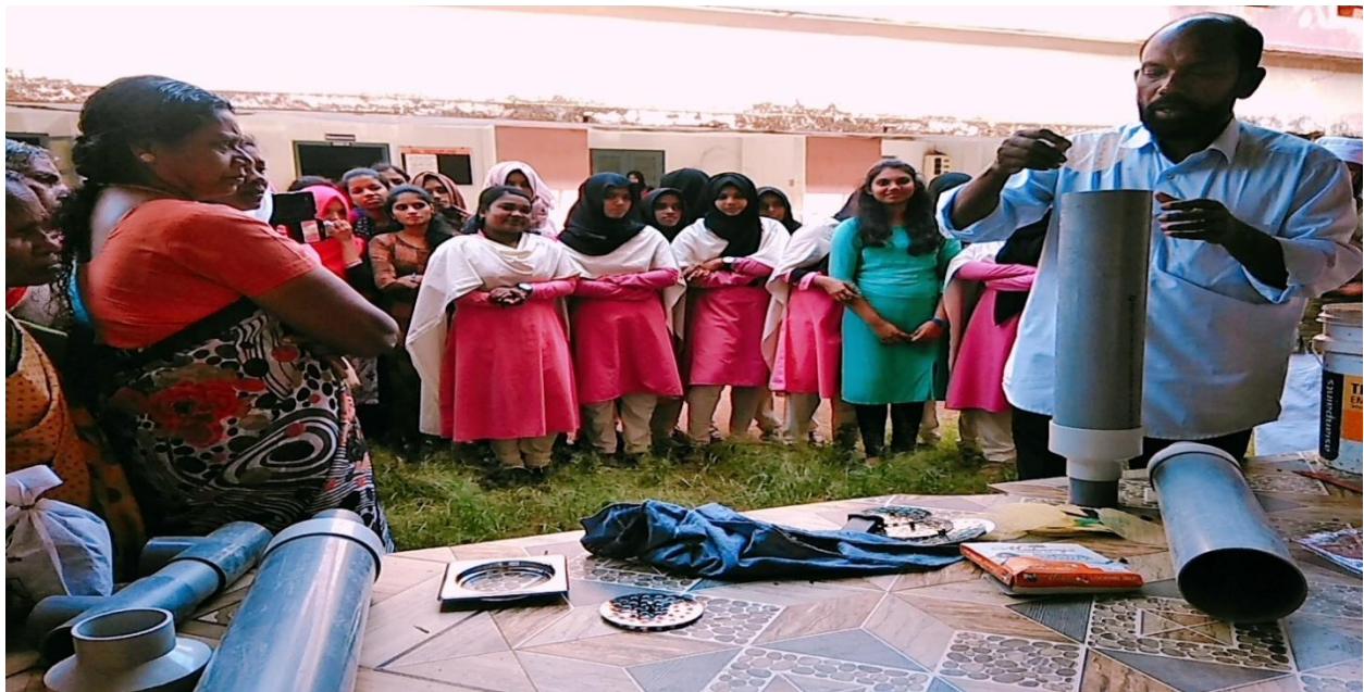
Demonstration class on well recharging as a part of Environment Management Training