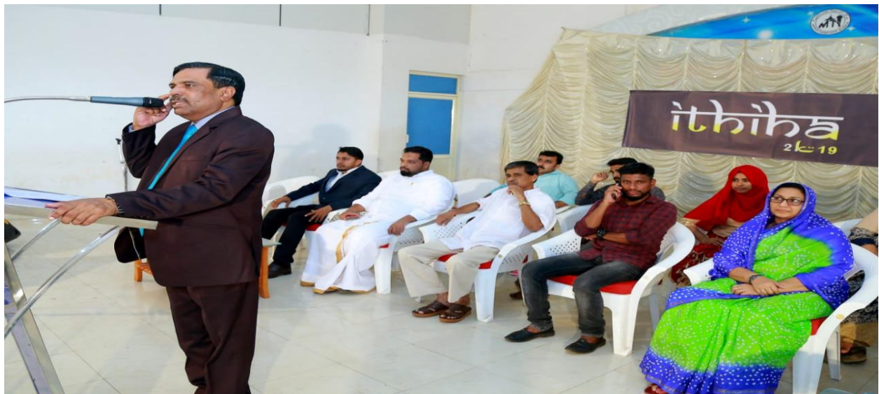
Justice P.Ubaid of Kerala High Court