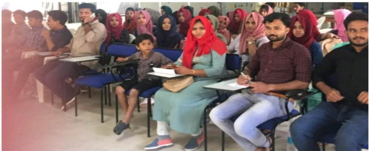
Students at Mysore university