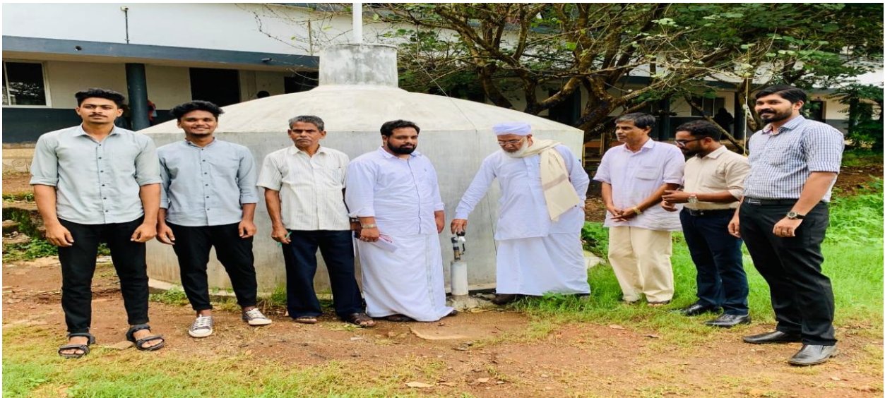
Rain water harvesting tank by PTA

The PTA executive was held twice this year. Two water purification units and one Rain water recharge tank were constructed by PTA. Two students were given scholarship and two NET coaching classes conducted.