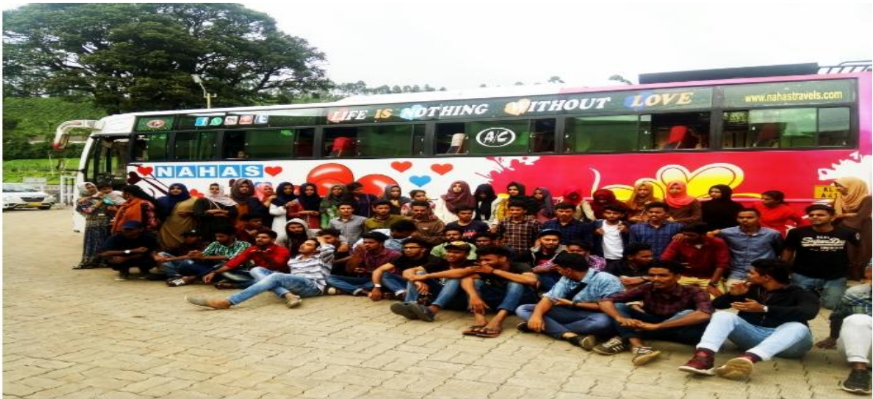
Industrial visit conducted by Final year student's of Commerce & Management department to Kannan Devan Tea Estate, Munnar