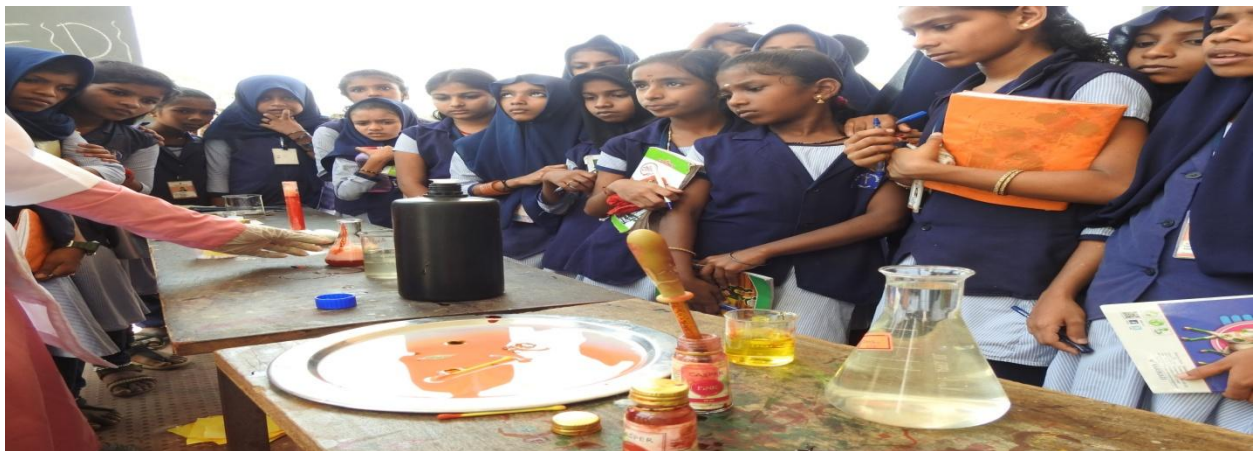
Students from neighboring schools also visited