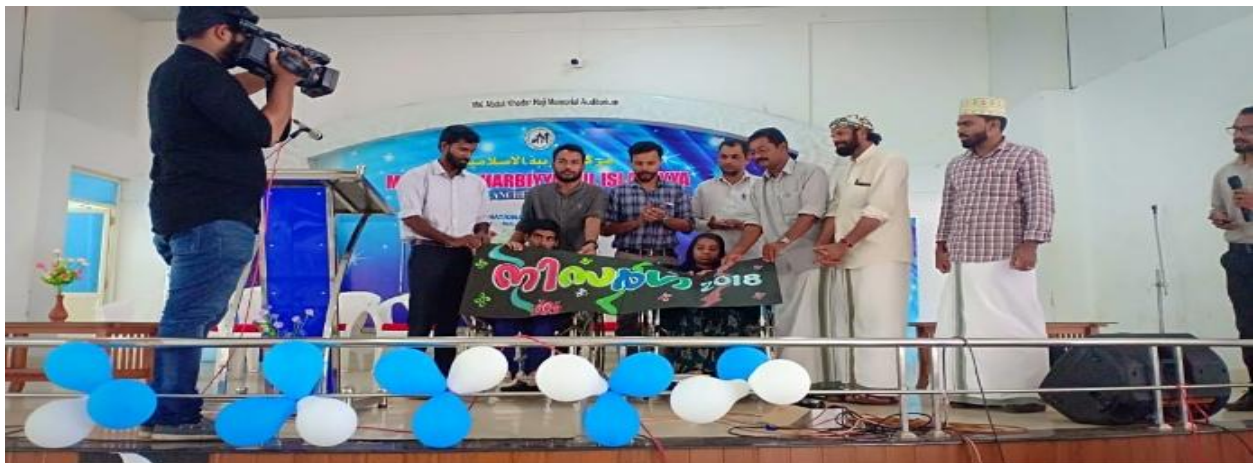
Inuaguration of Ponnani cluster NSS Arts fest 'NISARGA-2018' at Markaz Arts and Science College, Athavanad

12) Markaz NSS unit conducted Zone 5 NSS Arts fest "NISARGA-2018" with the participation of NSS units of 10 nearby college's at Markaz campus on 25th November 2018.