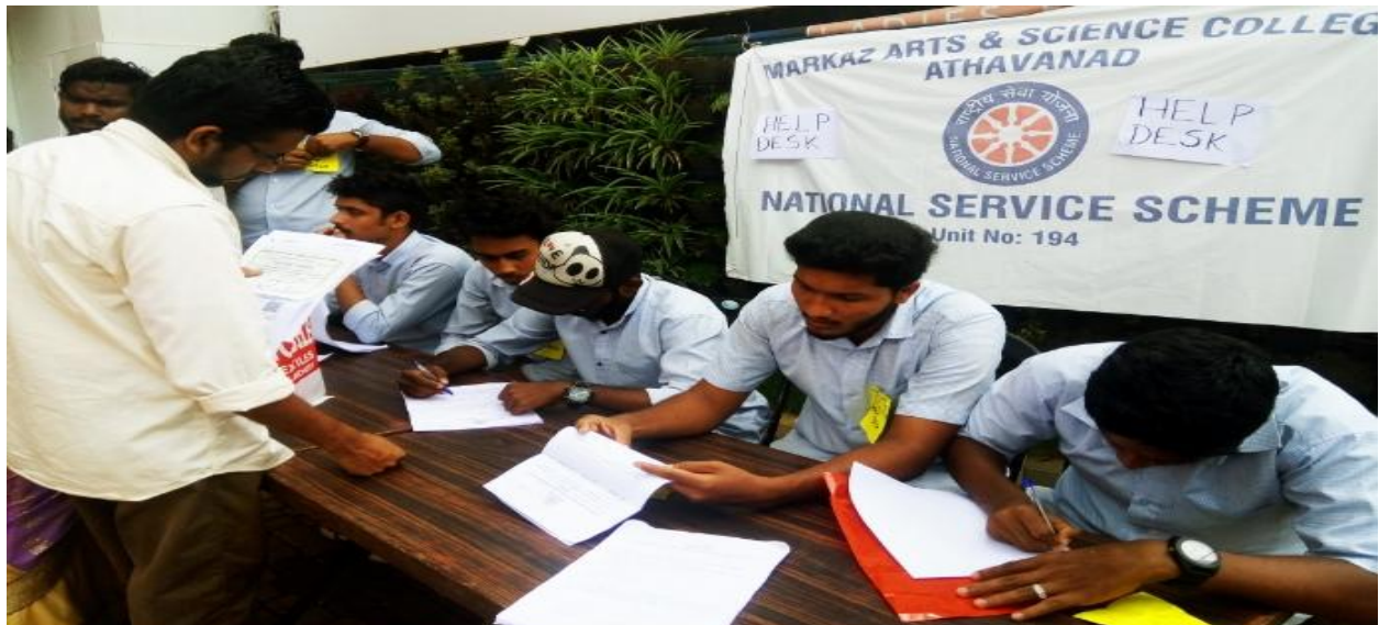
Ration Card help desk by NSS volunteers in Valanchery Municipality