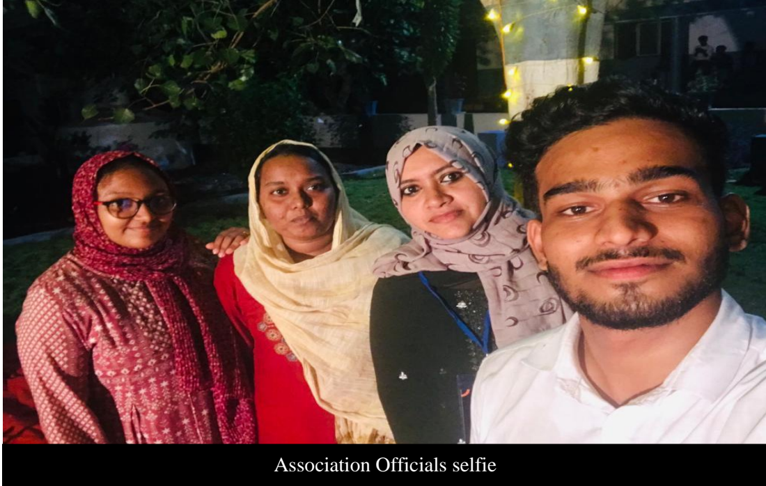
Association Officials selfie