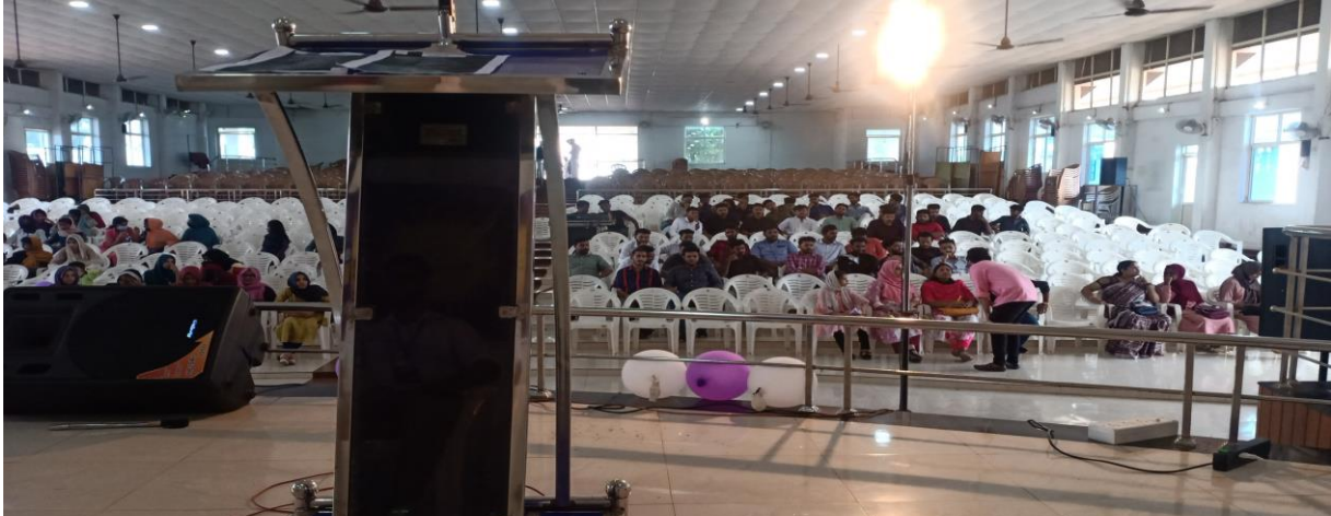
The Inaugural Dias