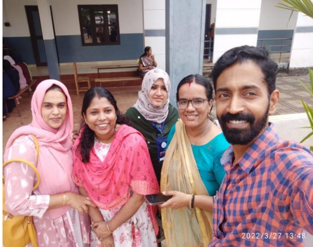
2004-08 Batch Alumni