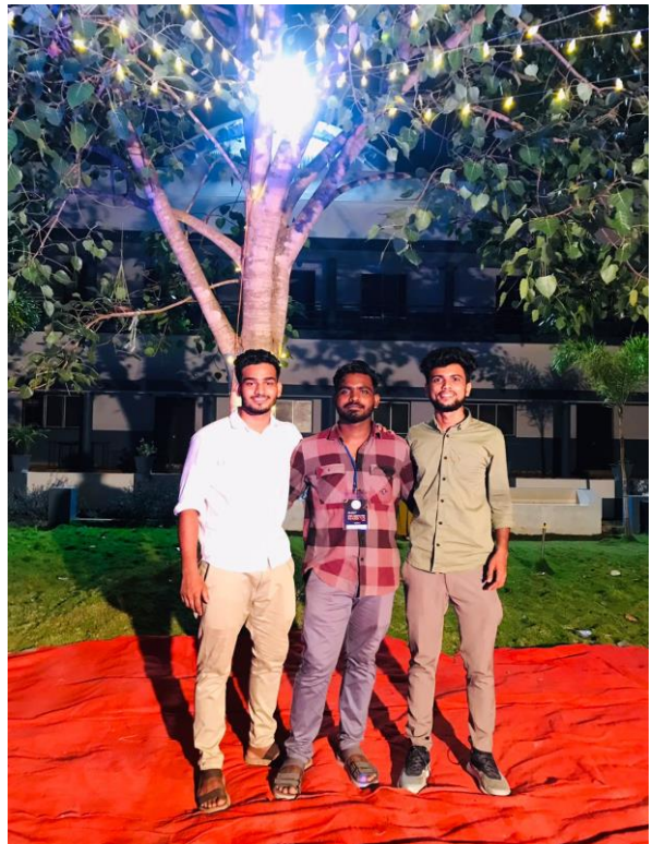
Gazal Night snaps