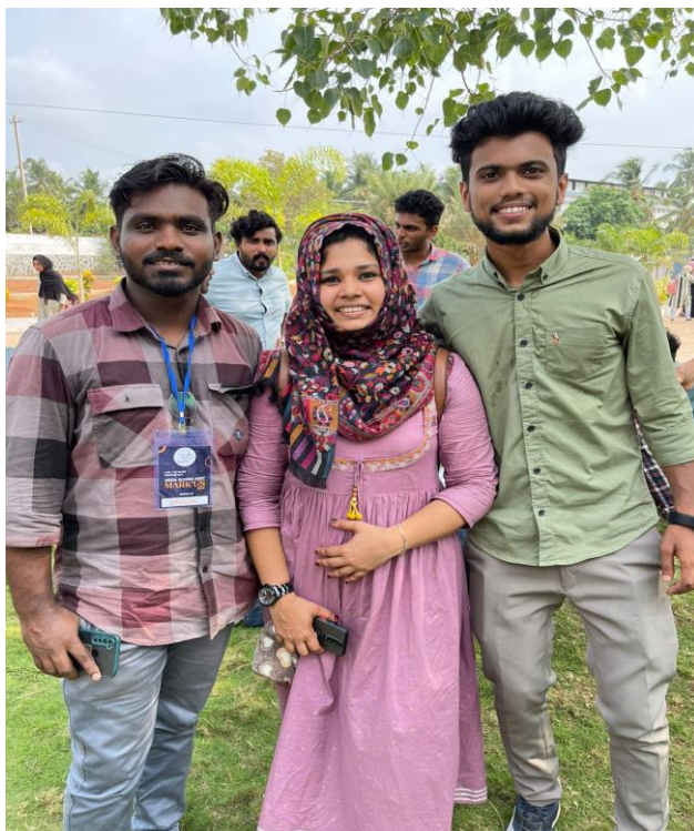
Alumni's with respectful teachers