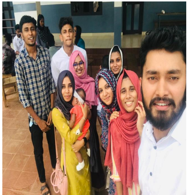
Batch wise interactions at Campus: