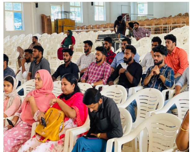
The Audience: Alumni's of Markaz Arts & Science College