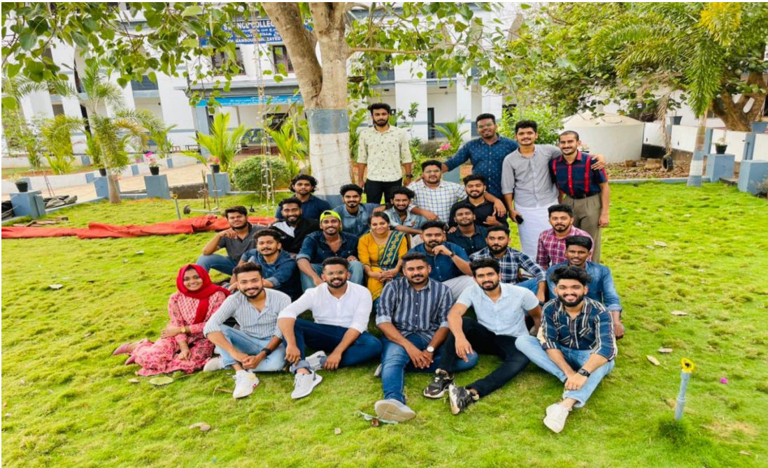
Commerce and management Alumni's