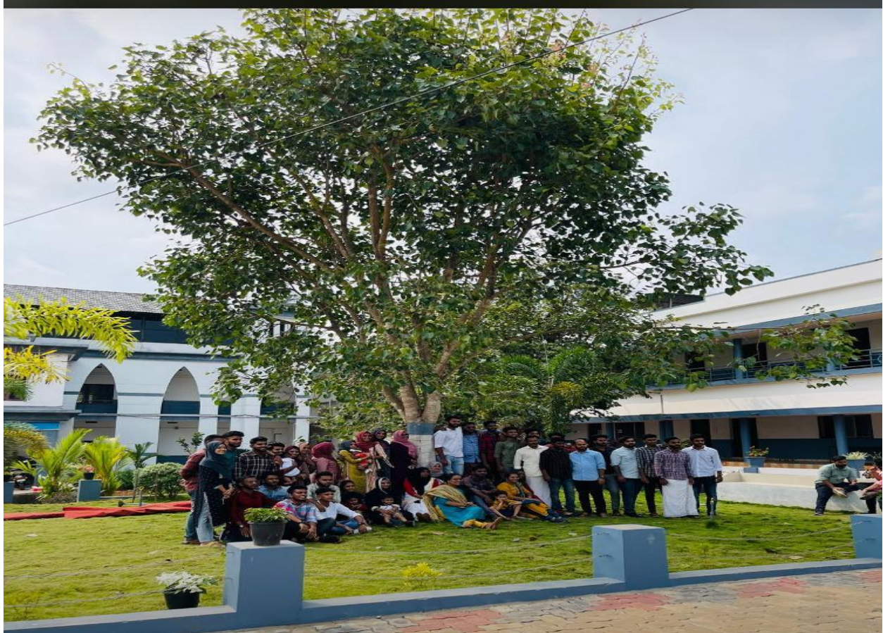
Batch wise interactions