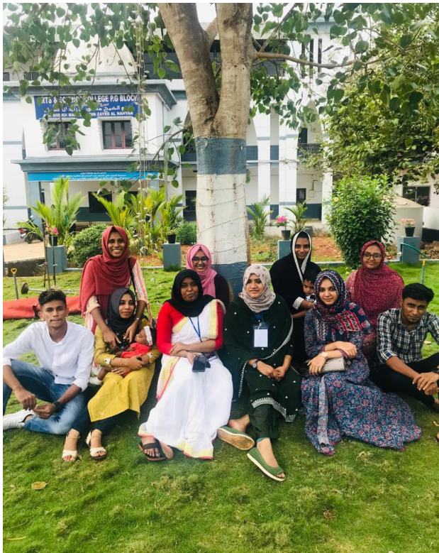
BSc .Biochemistry Alumni's