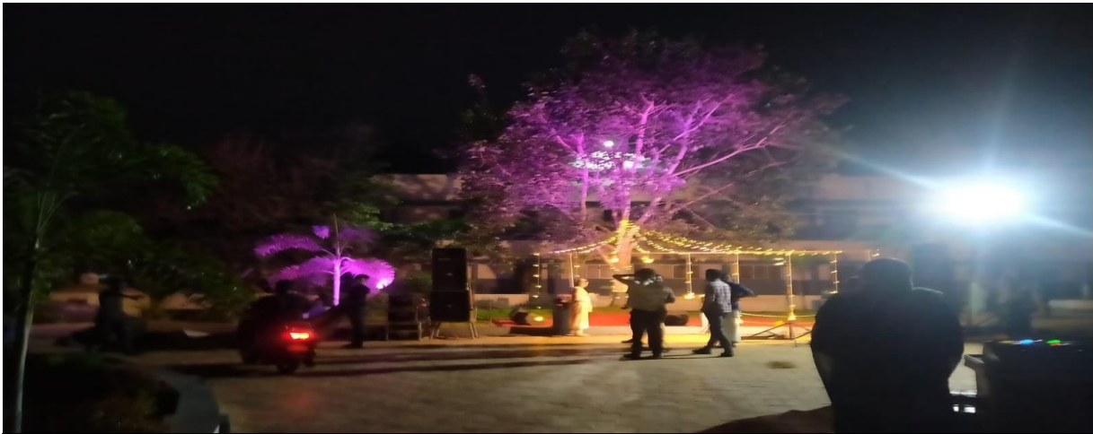
The Gazal Night