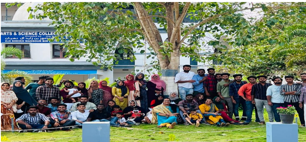
Batch wise photo session