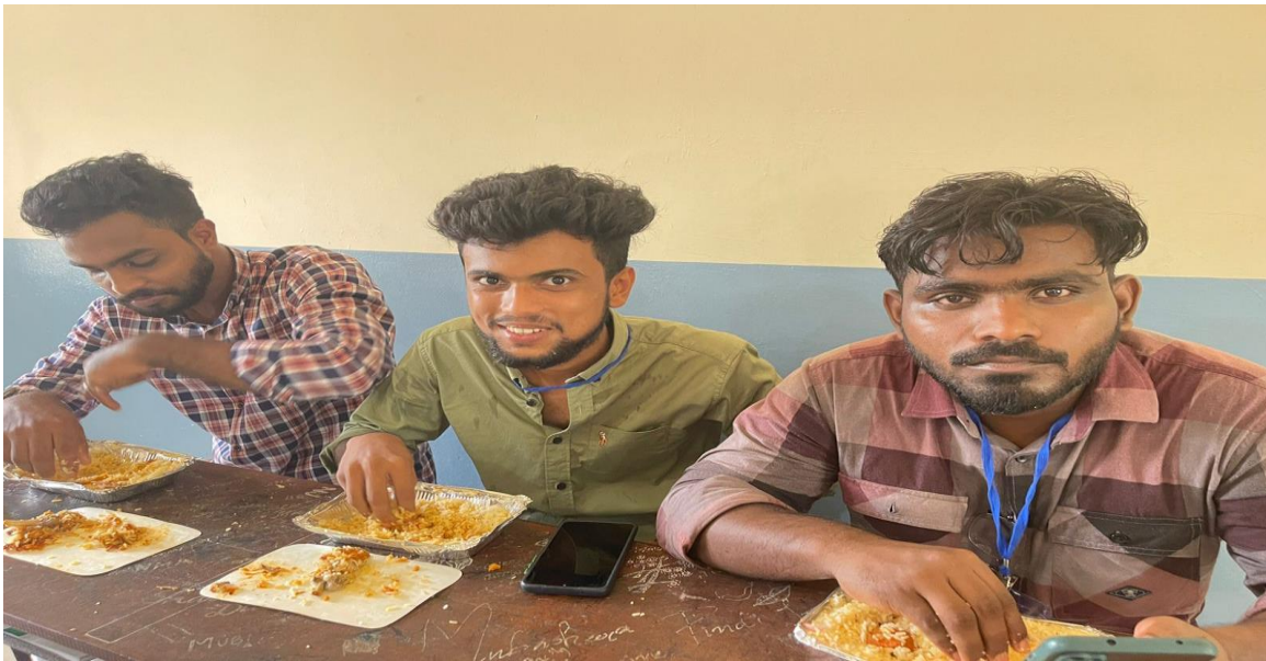
The Alumni Association provided delicious food to all the members gathered for Alumni Meet.