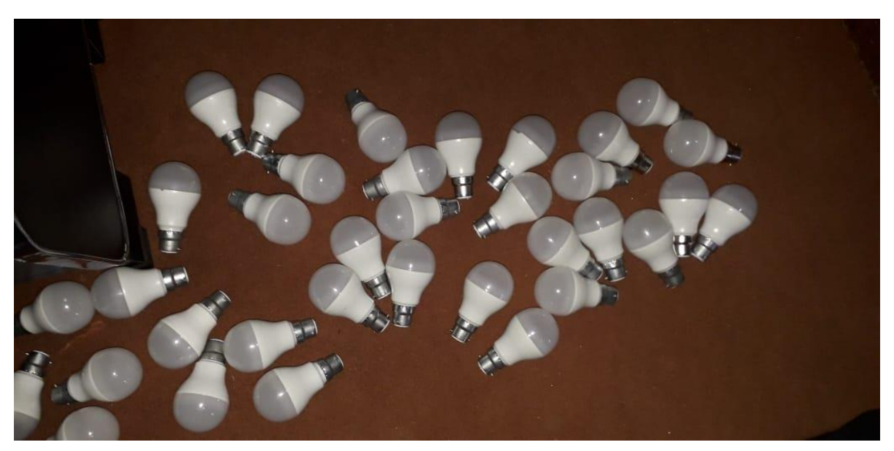
LED bulbs made by students