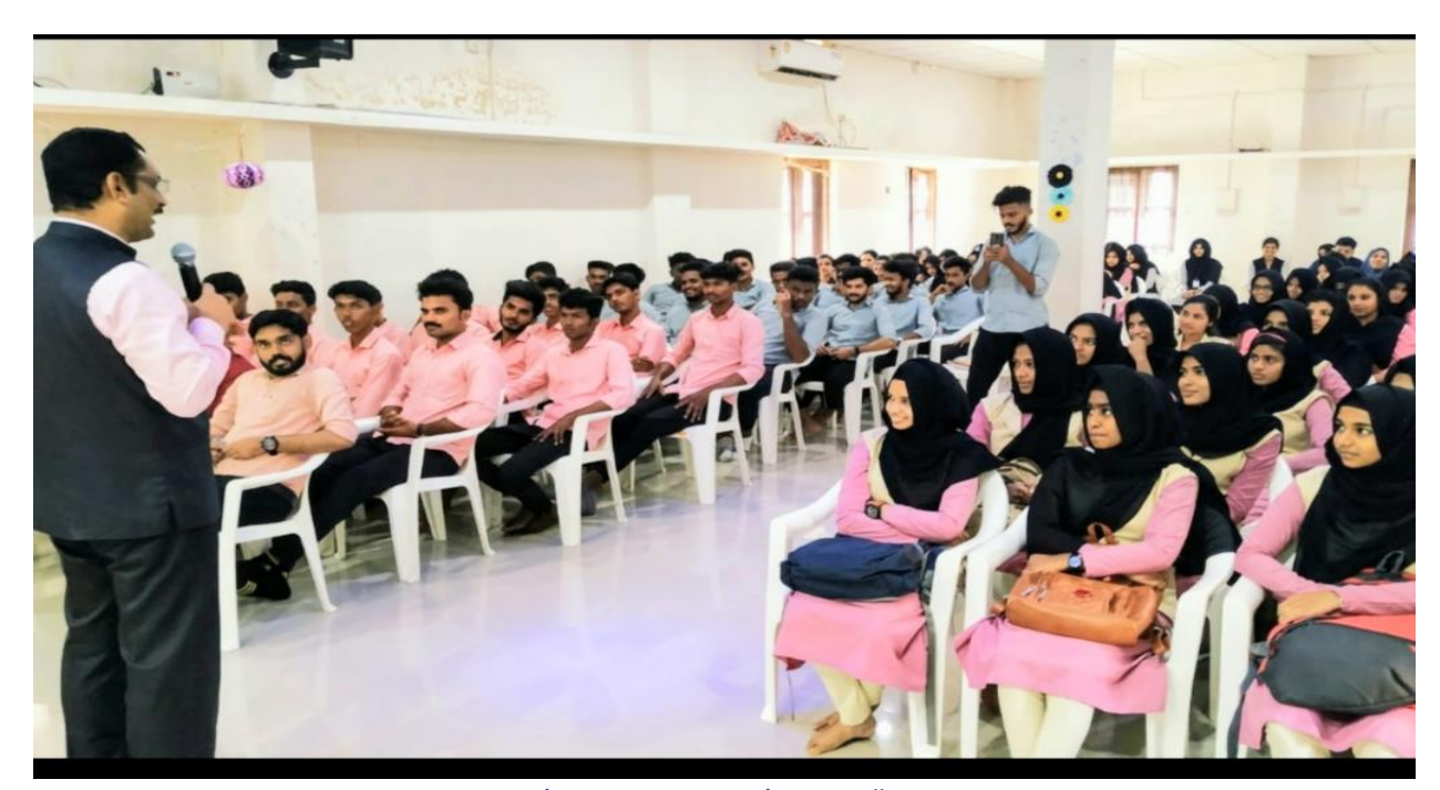
Seminar on "Accounting Excellence"