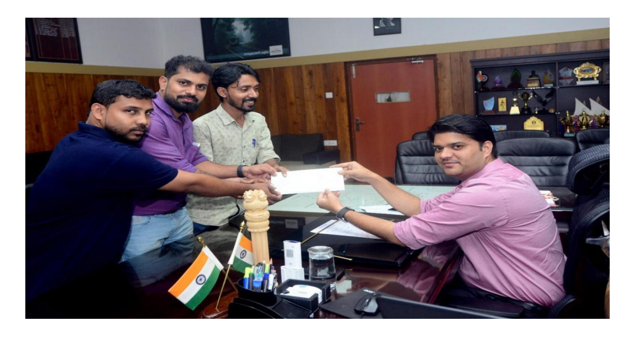
Handing over relief fund collected by Alumni to District Collector, Malappuram