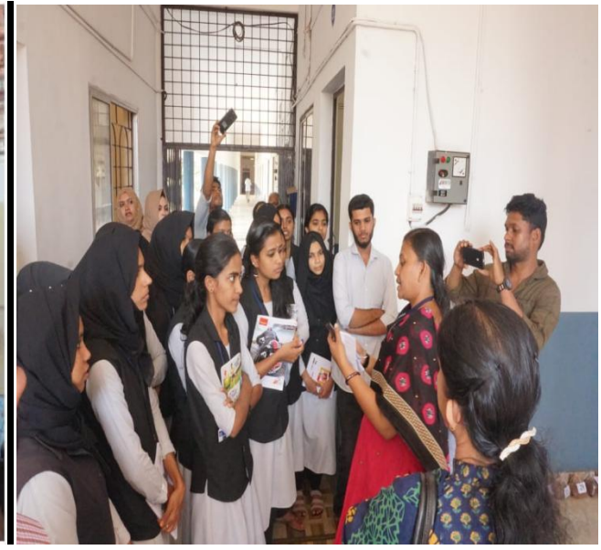
Blood grouping for the locals by Biochemistry