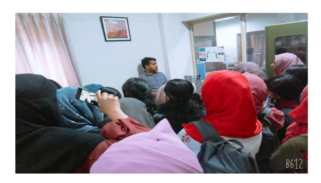
From demonstration class on instrumentation at NIT, Calicut