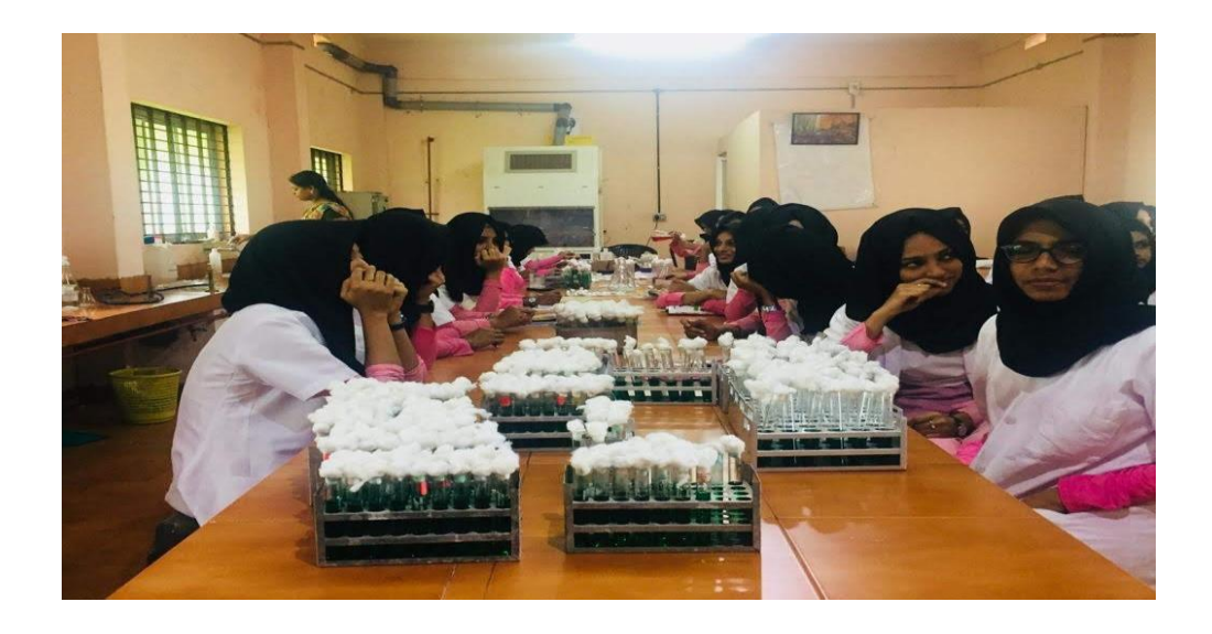
From water analysis in the adopted village by students of Microbiology department

Department of Microbiology conducted water analysis in the adopted village. Biochemistry conducted blood grouping for the locals of the adopted village and Department of Chemistry analysed the soil samples taken from the adopted village. Women Empowerment cell organized a one day LED assembling training.