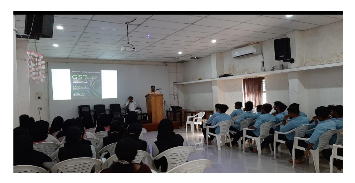
Class on GST by District Officer, GST

15. A seminar on "GST Awareness was conducted by Commerce and Management Department on 16 Jan. 2020.