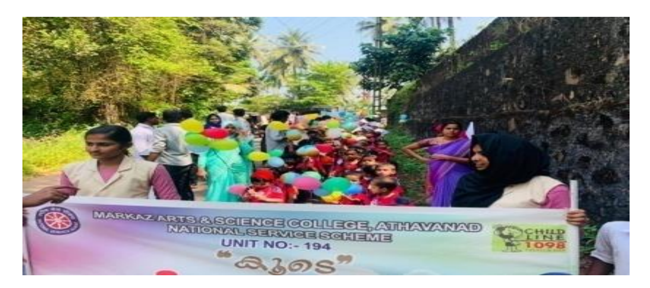
Nehru Jayanthi Celebration –Rally and competition