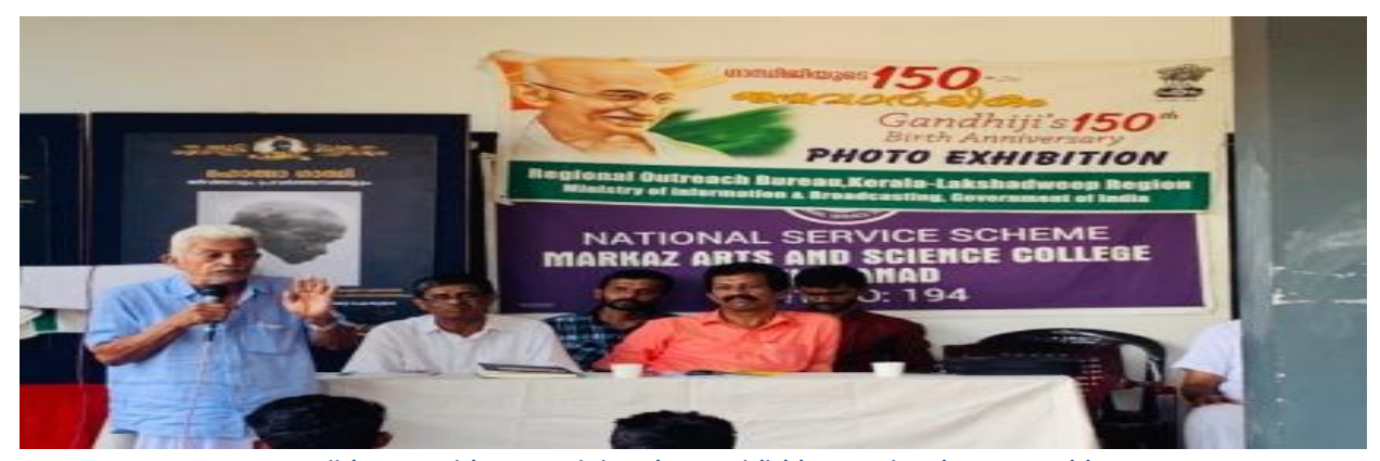
Gandhi Jayanthi Day Celebration- Exhibition and Quiz competition