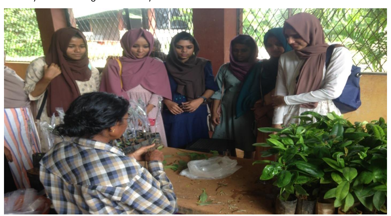
Students of Biochemistry at KAU Research Centre, Anakkayam