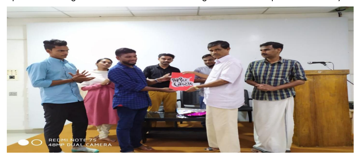
Principal, Markaz Arts and Science college releasing magazine published by English department