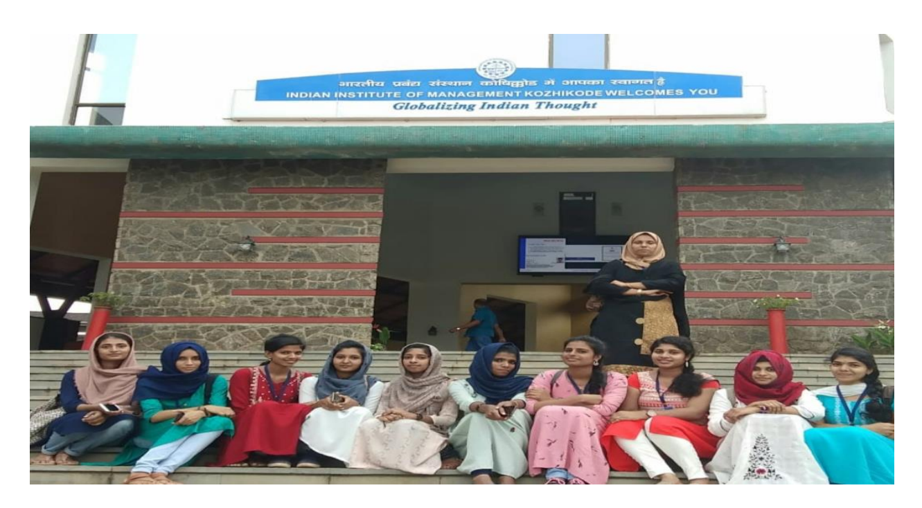
Visit to IIM campus, Kozhikkode by MCom students