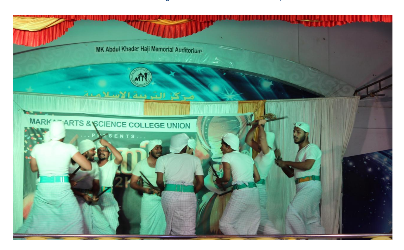
From cultural activities of the students on College annual day celebration