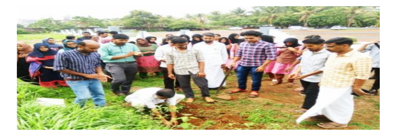
World Environment Day—Planting of seedlings