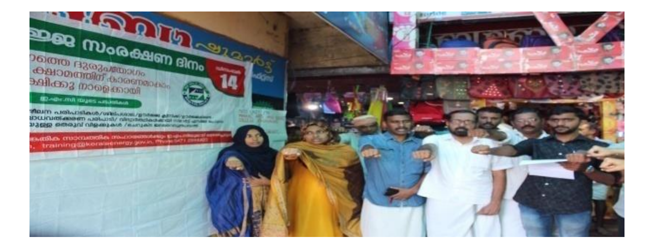
National Energy Conservation Day-Oath taking, Signature Campaign & Leaflet distribution