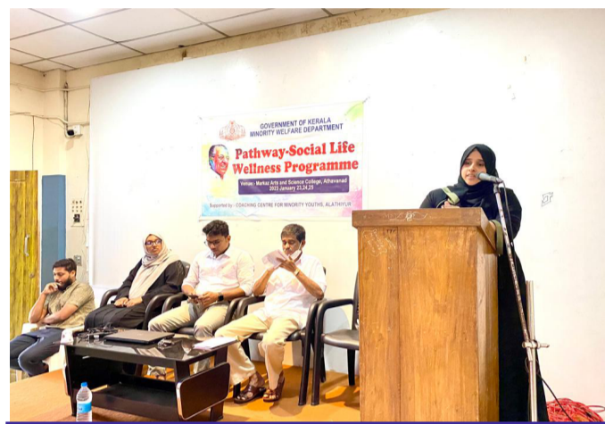
Pre marital Counselling programme sponsored by Dept of Minority Welfare