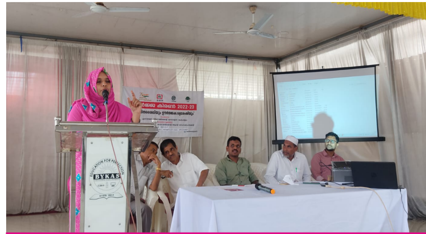
Energy Conservation Seminar at BYK Arts and Science College