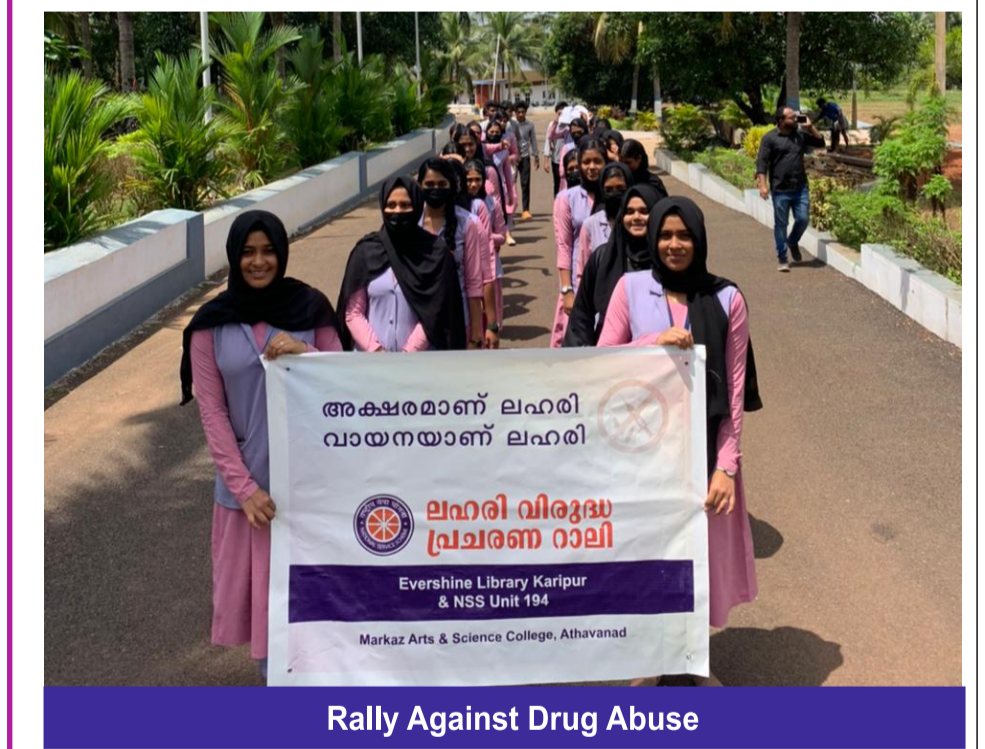
Rally Against Drug Abuse

In connection with world environment day, planting trees and a seminar on 'only one earth' were organized. Free eye check up camp was conducted at Athavanad Para in collaboration with District Mobile Ophthalmic unit, Tirur and cataract cases detected were sent to district hospital for operation.. Azadi Ka Amrithu Maholsav awareness campaign was conducted at Valanchery Municipal Auditorium , bus stand auditorium and in the campus, in association with Central Bureau of Communication, Information and Broadcasting ,Government of India, Palghat office . Seminars, Pookala competition, photo exhibition , cultural programme by Song & Drama Division and students and poster making competition were organised. NSS unit of our College initiated beach cleaning at Ponnani. NSS unit of our College conducted legal awareness programme in association with Tirur Taluk Legal Service committee, organised a anti drug awareness rally in association with Evershine Library and Volunteers participated in orja Kiran awareness Rally .