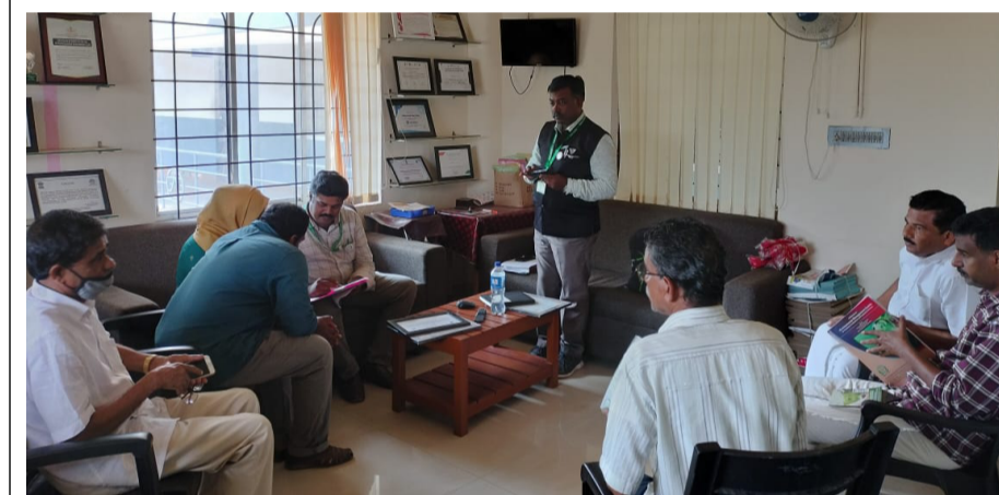
Energy and Green Audit team from Nature Science Foundation, Coimbatore