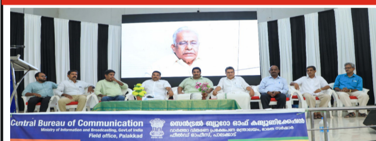
Central Bureau of Communication, Palakkad