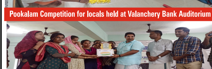
Pookalam Competition for locals held at Valanchery Bank Auditorium