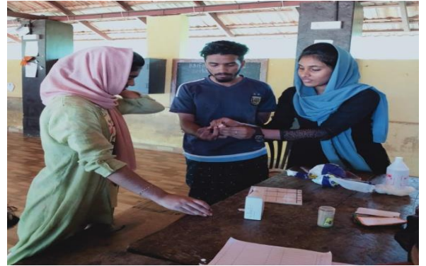
Figure 12: blood group determination camp