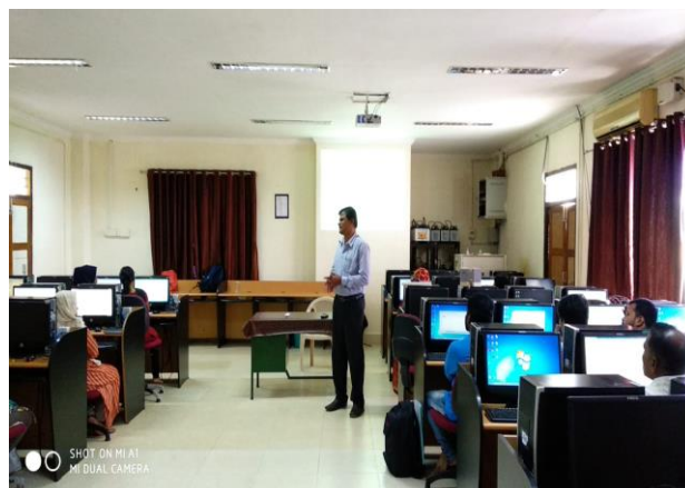
Figure 4: photos of training programme attended by faculties