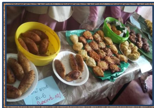
Figure 13: Food fest photos