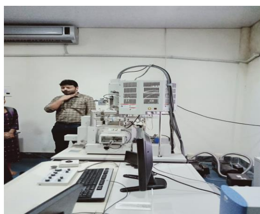
Figure 7: Faculty of NIT explaining instruments