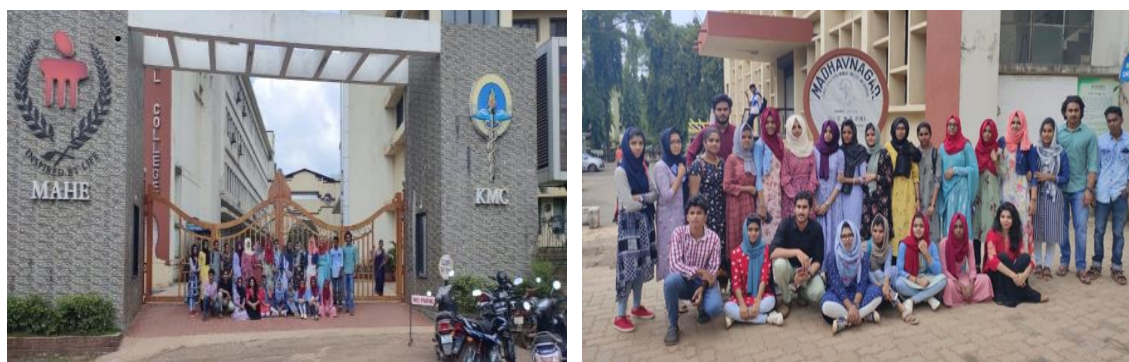
Figure 9: students at Kasthurba Medical College