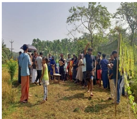
Figure 17: NSS Programme