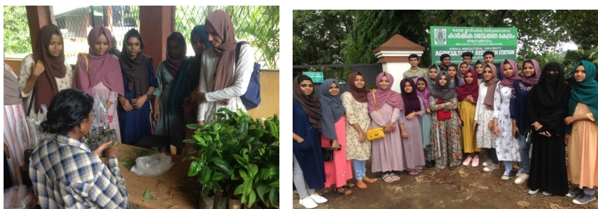
Figure 8: students at KAU,Anakkayam