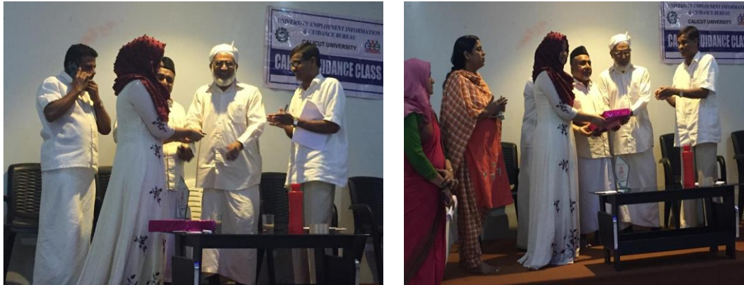
Figure 15: Honouring M.Sc. Topper of Calicut University