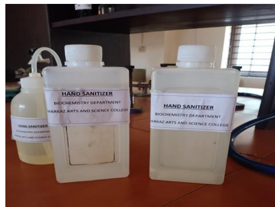
Figure 16: Sanitizer made by Department and inauguration