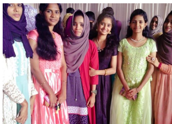
Figure 18: photos of alumni programme