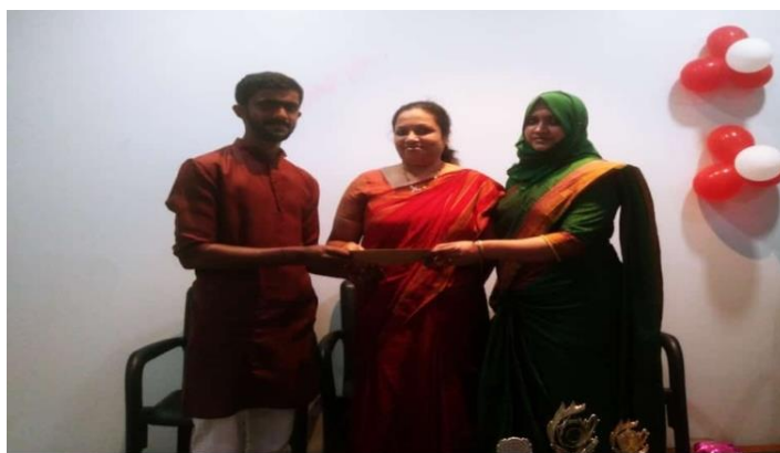
Figure 11: Handing over of fund from food fest to NSS coordinator