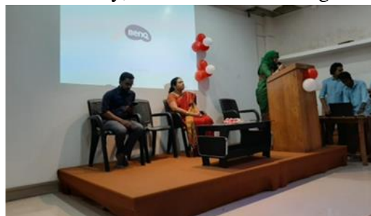
Figure 14: Association Inauguration