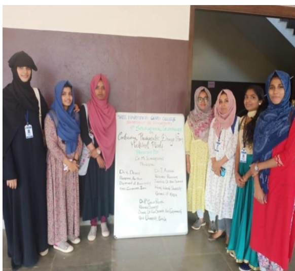
Figure 5: students attending International Conference