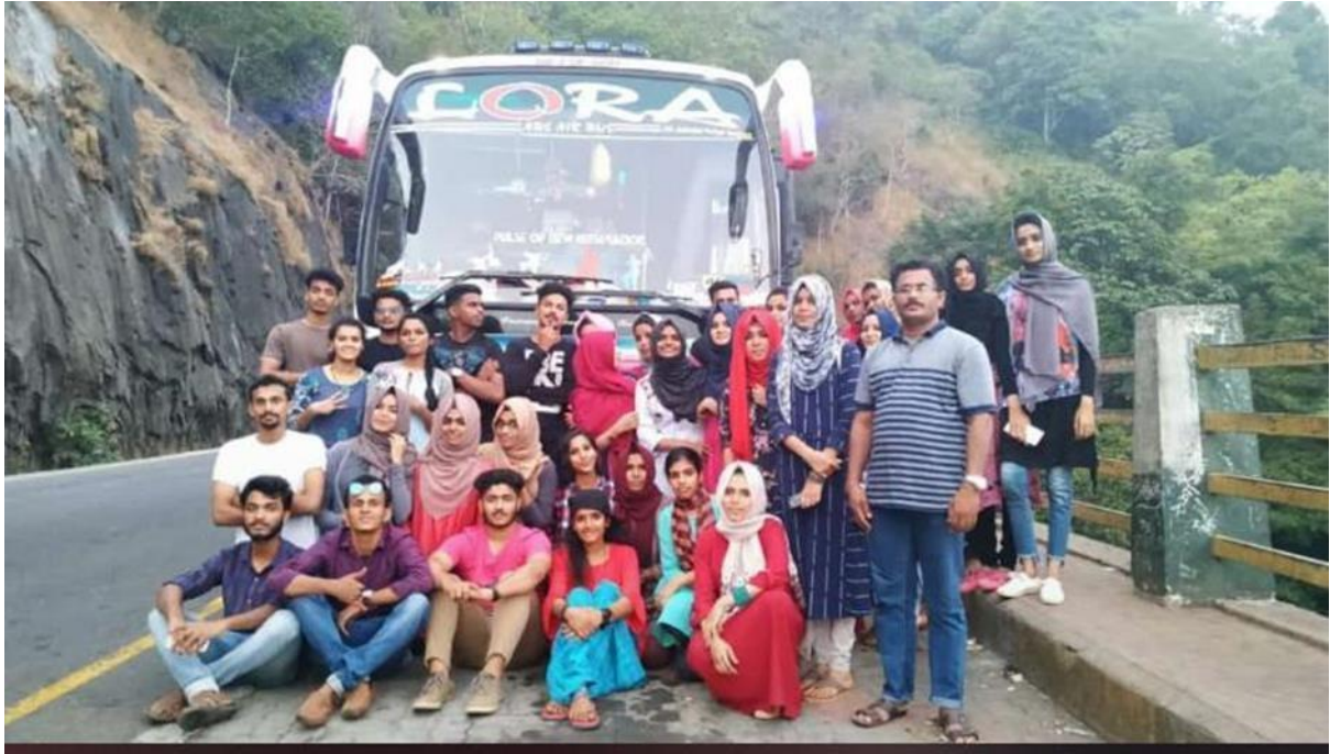
FIELD TRIP TO WAYANAD