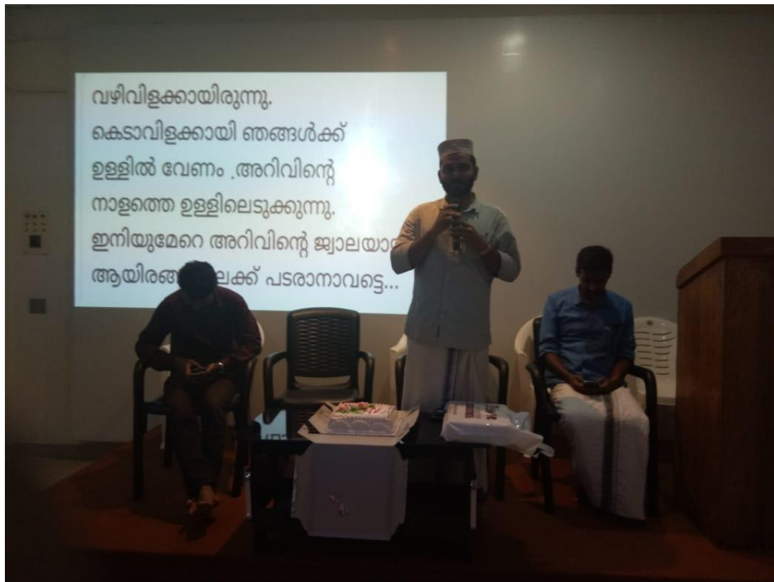
YEAR ENDING FUNCTIONS