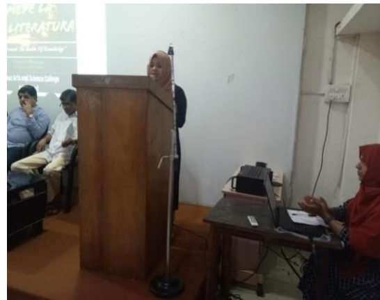
GLIMPSES: ONE DAY WORKSHOP