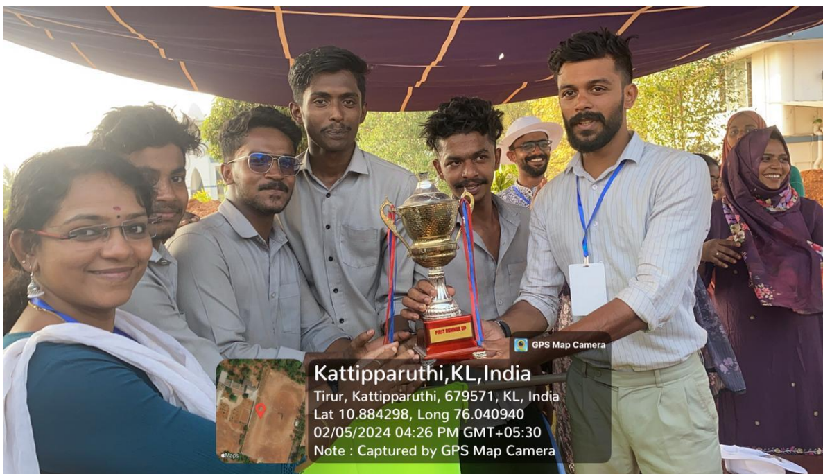
Runner of Invicta sports meet 5/2/2024 (team green)