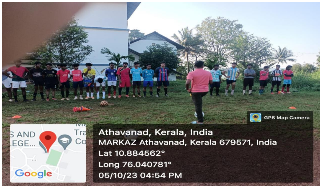
Interaction with players

Markaz arts and Science College Football team participated. B zone tournament held at EMEA College of Arts and Science Kondotty on 10/10/23. 20 students and one Faculty Member