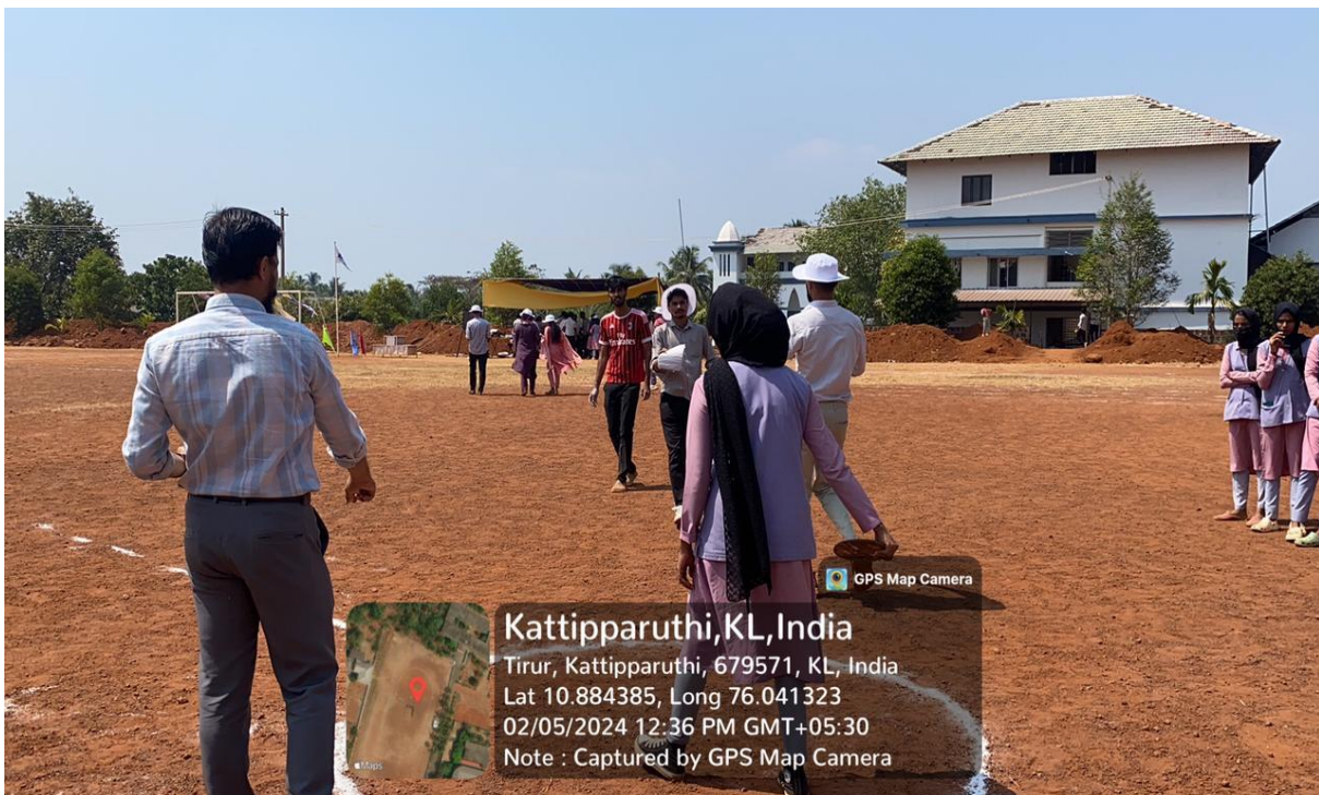
Discus throw women