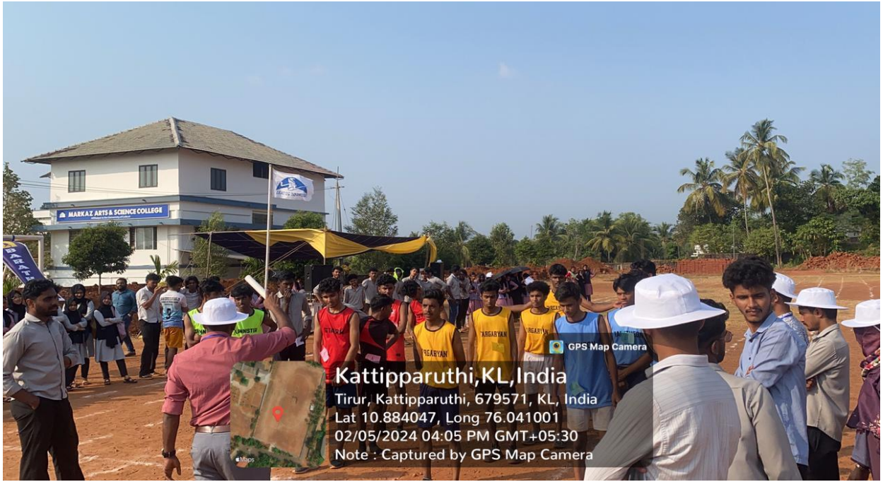
4*100 mtr relay start