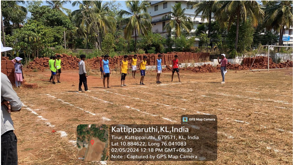
100 mtr start