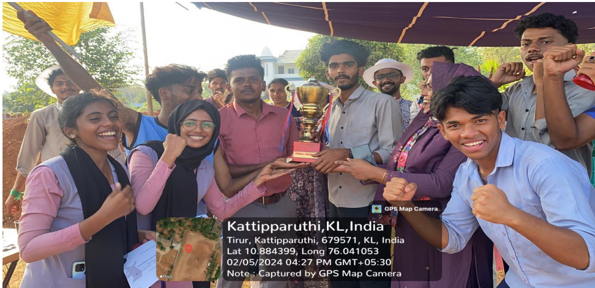
Champions of Invicta sports meet 5/2/2024 (Team Blue)