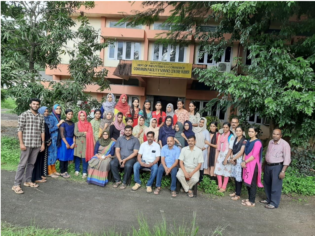
Three days Training at Common Facility Service Centre Manjeri