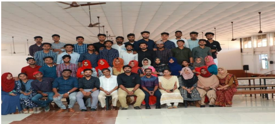
B.Com 2018-19 Batch