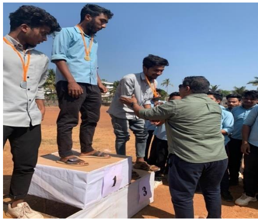
Students Participated in Inter Markaz Football tournament