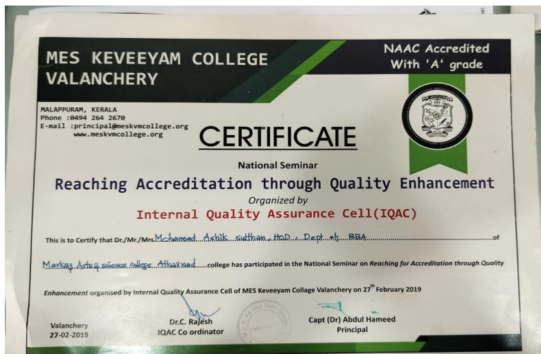
Certificate of Ashik sulthan ,Seminar attended