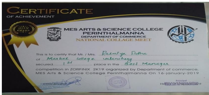
Certificate of Rezmiya Fidha