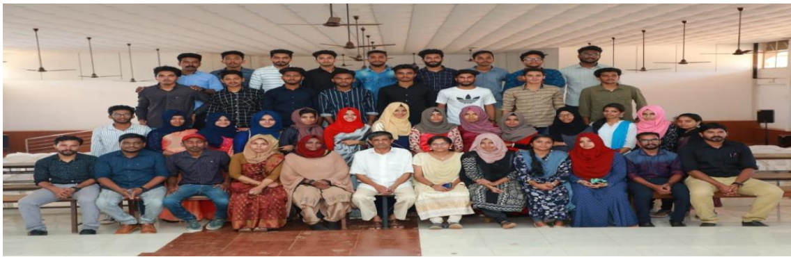
BBA Batch 2018-19