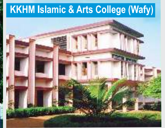
KKHM Islamic & Arts College (Wafy)