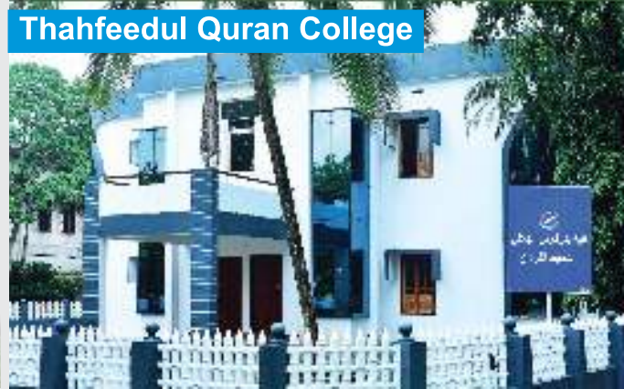
Thahfeedul Quran College