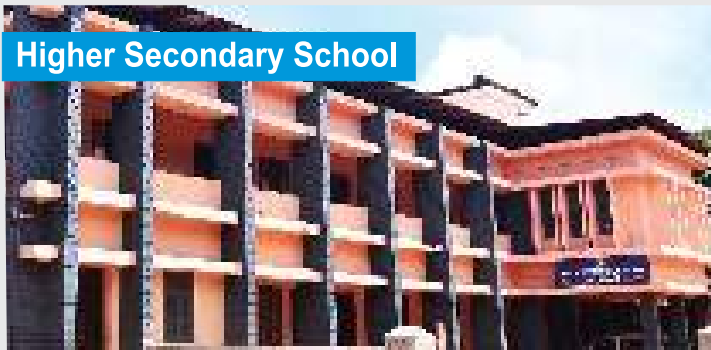
Higher Secondary School