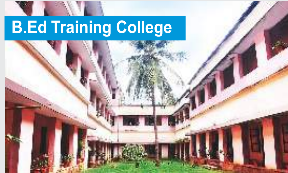
B.Ed Training College