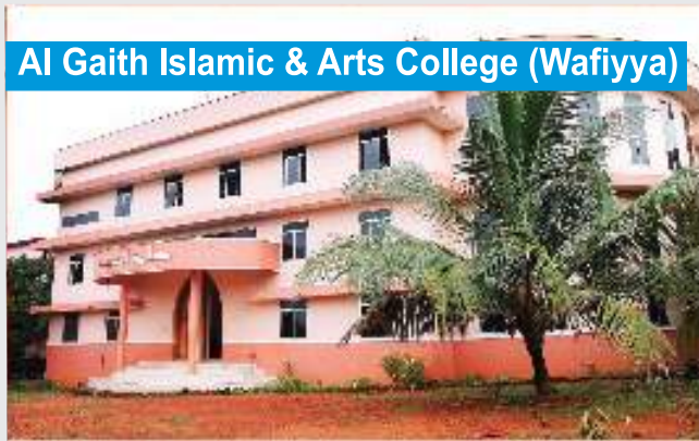
Al Gaith Islamic & Arts College (Wafiyya)