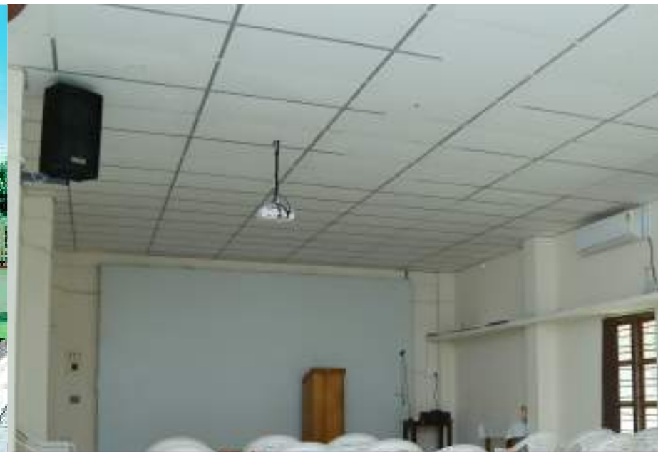
VISUAL AND AUDIO HALL