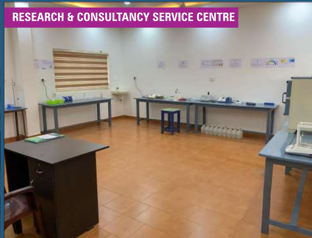
RESEARCH & CONSULTANCY SERVICE CENTRE