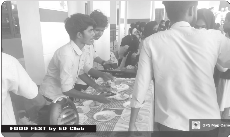
FOOD FEST by ED Club