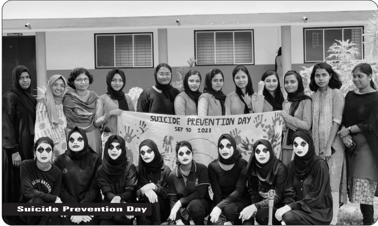
Suicide Prevention Day