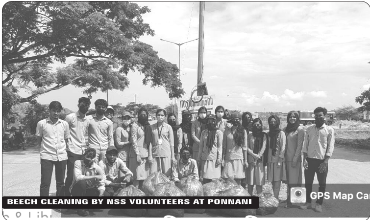
BEECH CLEANING BY NSS VOLUNTEERS AT PONNANI