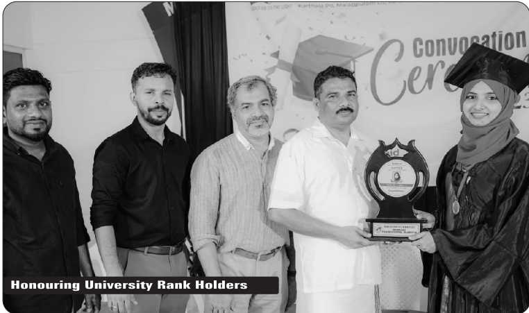
Honouring University Rank Holders