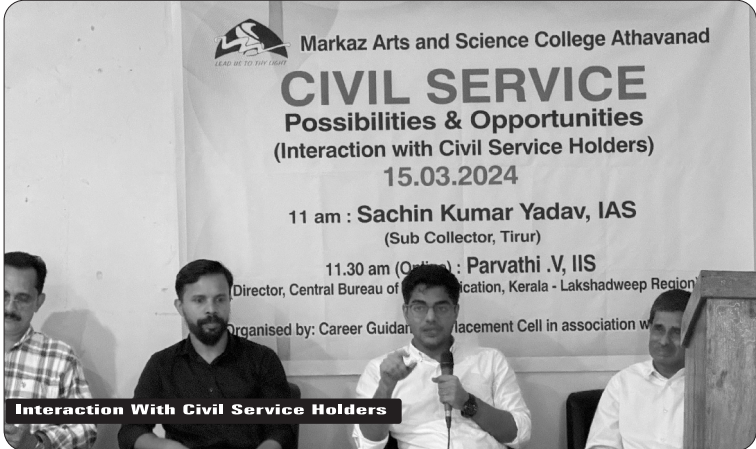
Interaction With Civil Service Holders